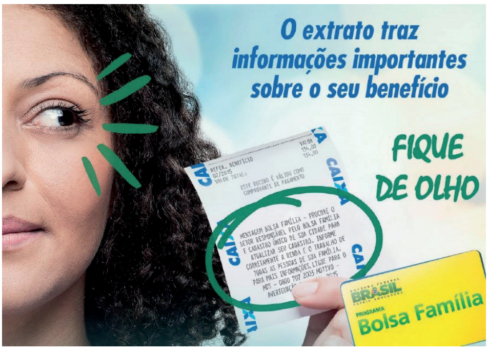
Figure 1: Message on the Bolsa Familia payment receipt

Caixa, with the support of the MDS, launched a publicity campaign called "Keep an eye on the Bolsa Familia message", to draw the attention of beneficiary families to the importance of reading everything printed on the receipts when they withdraw the funds at ATMs. The Bolsa Familia management network was recruited to display a series of posters in strategic places normally used by beneficiaries such as health centers, bus-stops, schools, etc. (Figure 1)<sup>1</sup>.