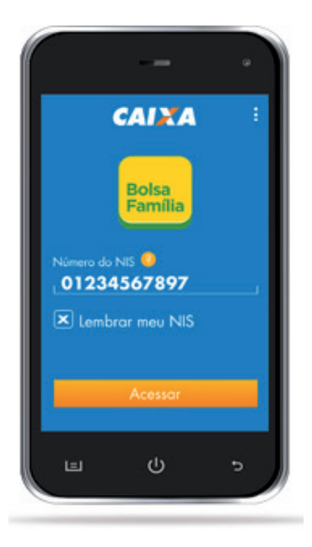
Figure 2: Bolsa Familia Smartphone Application