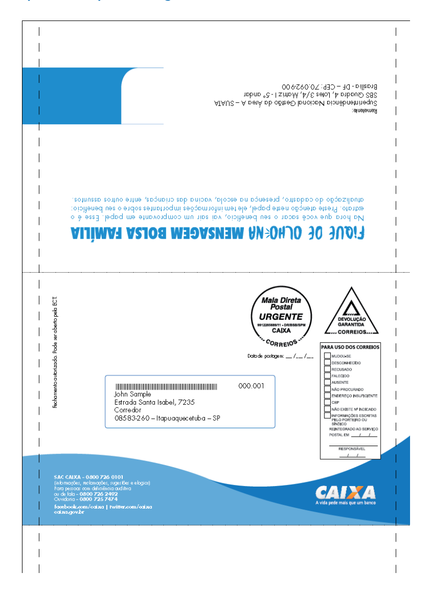
Figure A1: Example of envelope containing the first letter to beneficiaries